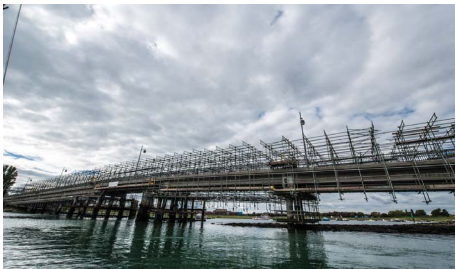
Haslar Bridge, Gosport